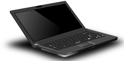
Figure 1: “Notebook” under CC0 1.0; from Pixabay