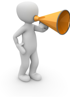
Figure 3: "Man with megaphone" under CC0 1.0; from Pixabay