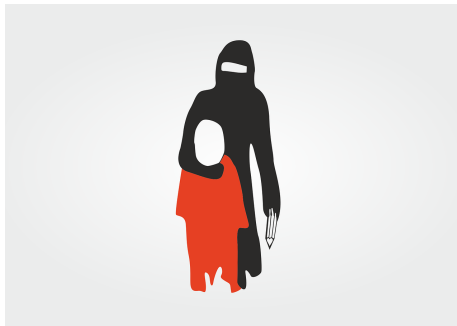
Figure 5: “Control”