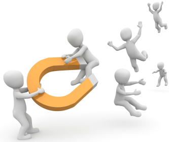
Figure 4: “Figure” under CC0 1.0; from Pixabay