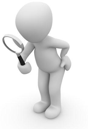
Figure 2: “Search”