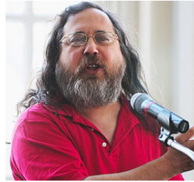
Figure 6: “Photo of Richard Stallman”